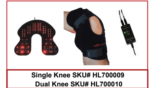
Single Knee SKU# HL700009 Dual Knee SKU# HL700010

Includes: 2-Port Controller and Two Large Pads